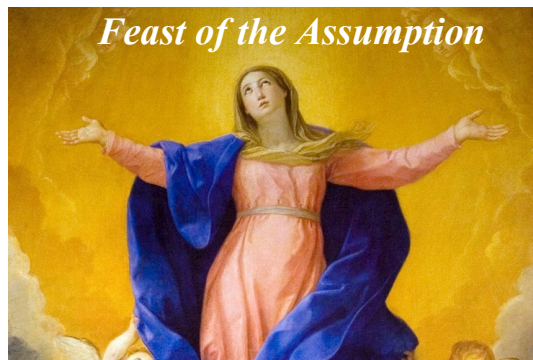
Feast of the Assumption

One further implication of what has just been stated above is that Mary's beauty in heaven is perfected. She is not a disembodied soul. She is not a spirit flitting about in paradise. The beauty that became espoused to the Holy Spirit lives in her fullness in heaven. This is one reason that the Church venerates Mary above all other saints.